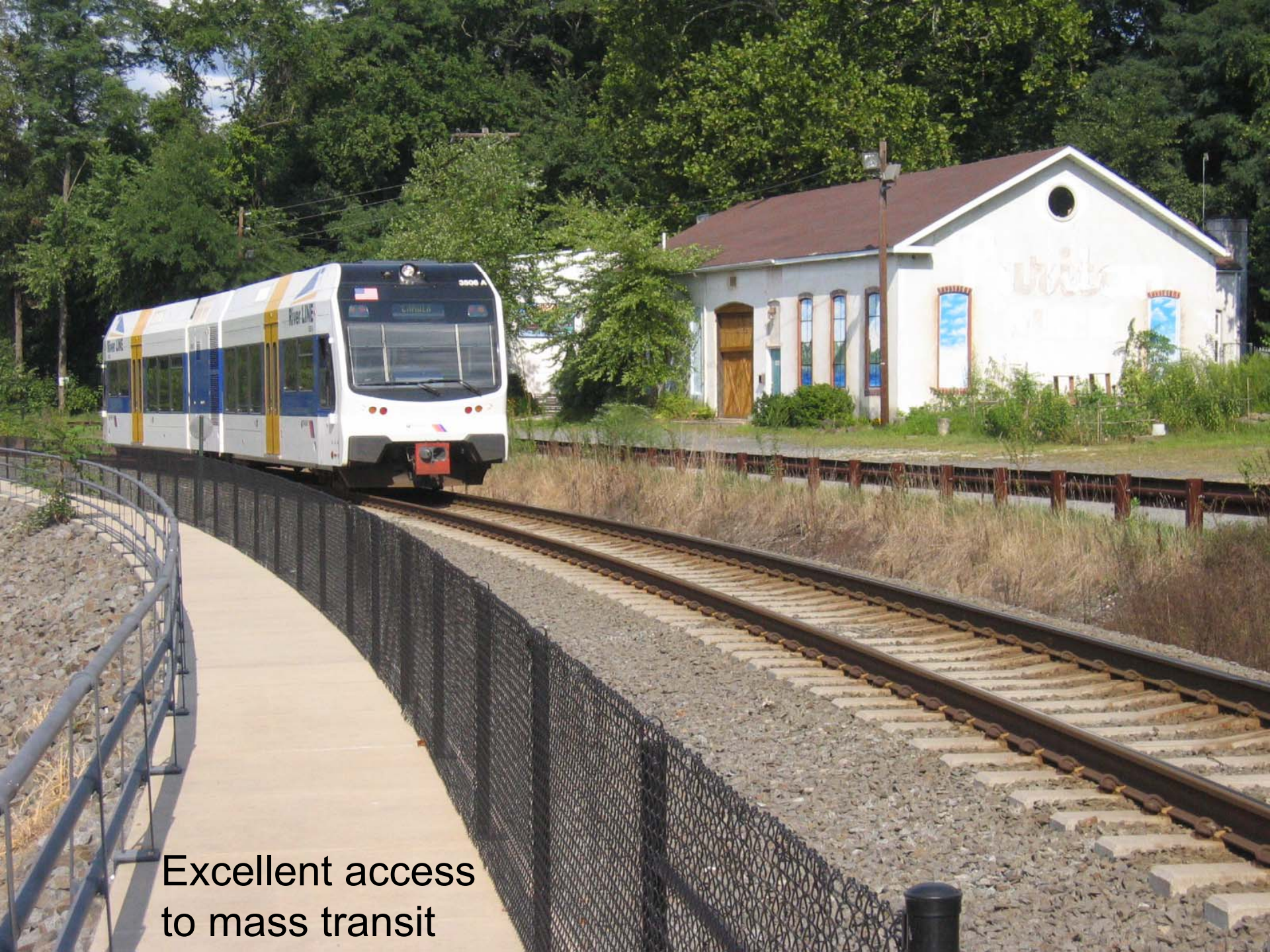
Excellent access to mass transit