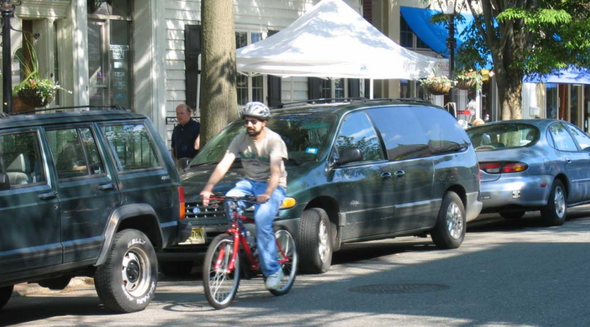
Compact, mixed-use community